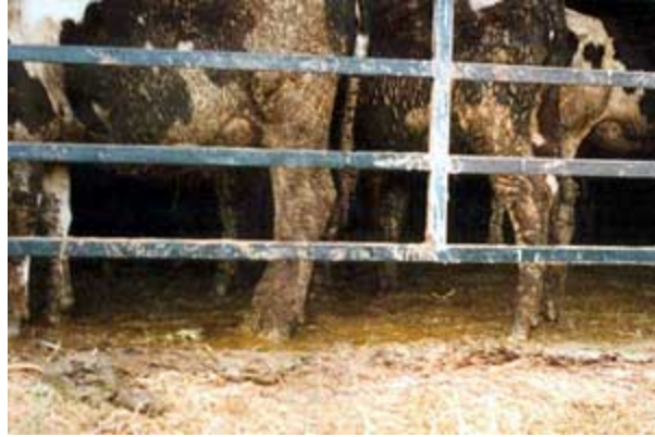
Clean Cows, Clean Milk.

Note: When your stomach acid is as high as it should be, it will kill all bacteria and viruses that enter the stomach.