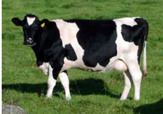
It's Not Just For Cows.